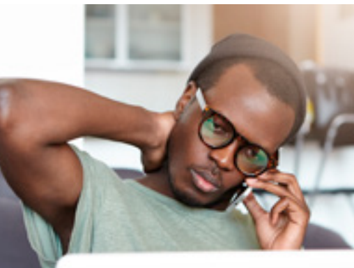
Don't just take their word for it. Ask the appropriate questions.

But you can identify an actual debt collector with three simple questions, according to thesimpledollar.com :