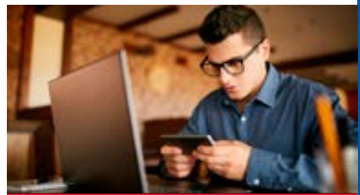
Be careful using free wi-fi. Just becausse it's free, doesn't mean it's safe.

Because airbags stop the body, they prevent deadly head injuries and whiplash. But they do sometimes cause red impact burns on the body and break eyeglasses.