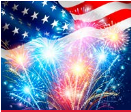
This Independence Day, remember those who made it possible.

If you suspect that you have a carpet beetle problem or want to avoid one, call Professional Carpet Systems so that we can clean your carpet, upholstery and drapery. That is a logical first step to eliminating these destructive invaders.