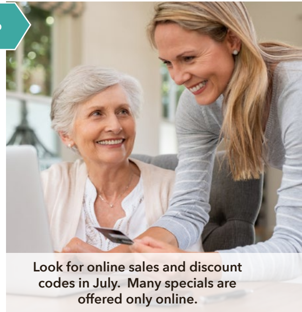
Look for online sales and discount codes in July. Many specials are offered only online.

Furniture and home goods are traditionally on sale around Fourth of July.