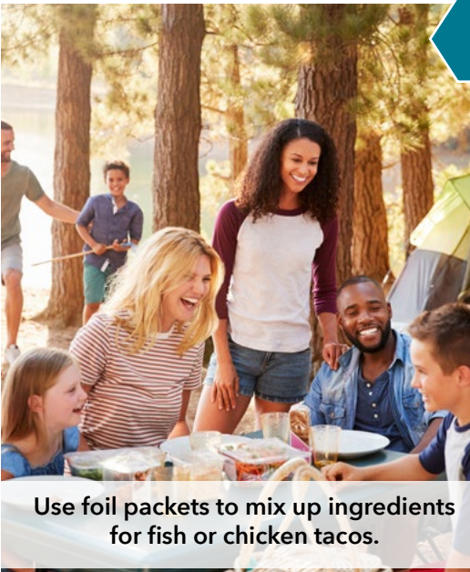
Use foil packets to mix up ingredients for fish or chicken tacos.

Sure, hot dogs are yummy and s'mores are fun and sentimental, but does the camping menu have to be so limited? No it does not. From hot breakfast sandwiches to decadent desserts, campground food can be anything you'd like.