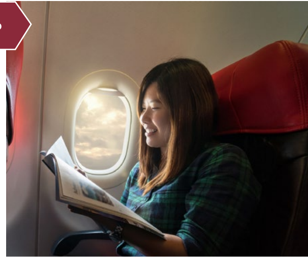
Follow airlines on social media to hear about upcoming insider deals and savings.

The least popular days to fly are Tuesday, Wednesday or Saturday, which also make them the cheapest. Avoid Friday or Sunday, which are the most popular days. Also look for very early or very late travel times to find better deals and discounts.