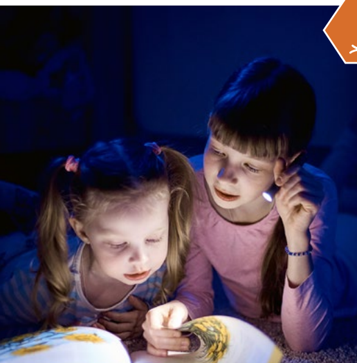
September is National Emergency Preparedness Month.

Create an emergency preparedness kit with these items: