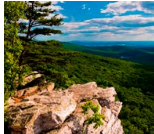
View from Annapolis Rocks along the Appalachian Trail on South Mountain Maryland.

If you have tough odor problems and need assistance, please call Professional Carpet Systems, and we will be happy to help.